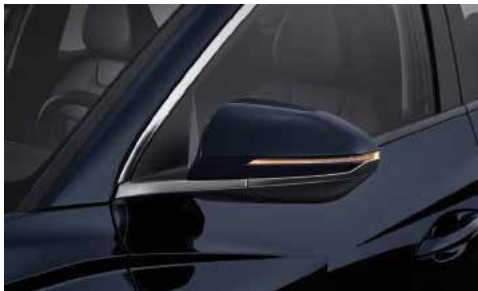
Turn Signal Indicator LED Outside Mirror