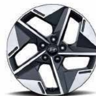
18" alloy wheels (Optional)