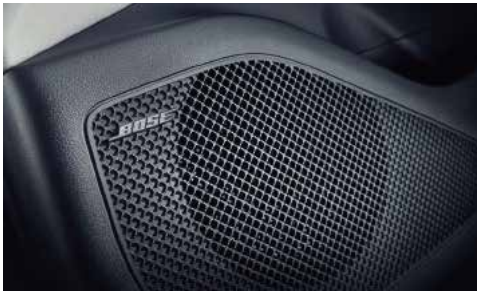
BOSE Premium Sound System