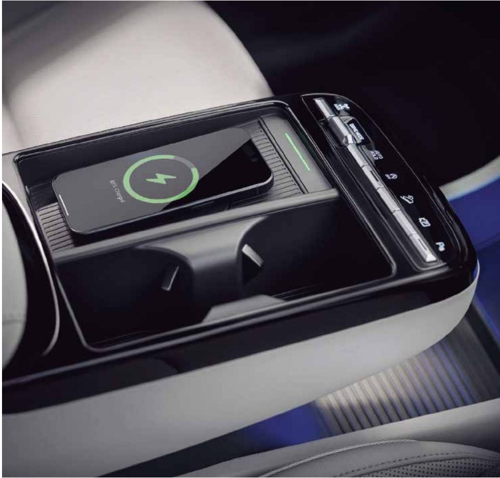
Wireless Power Charger (WPC)