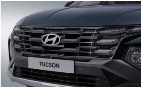
Dark Metal Paint Radiator Grille (Clear Type DRL)