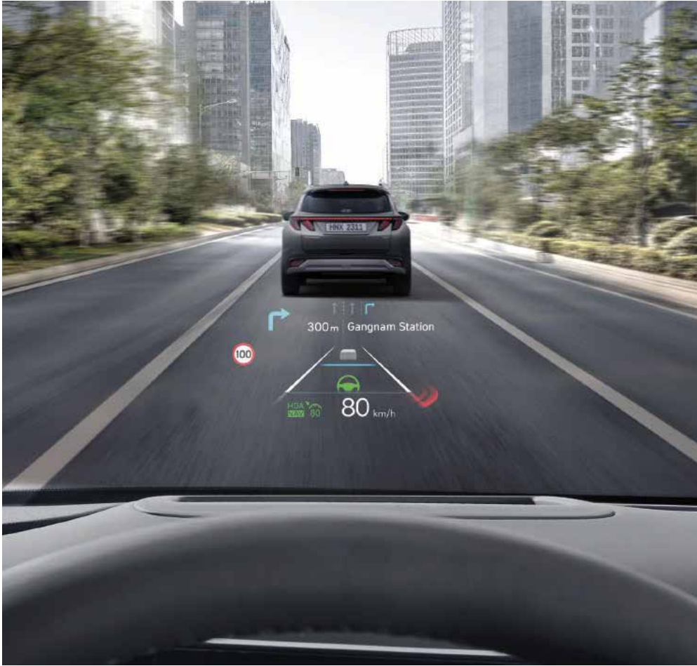
12-inch Head-up Display (HUD)