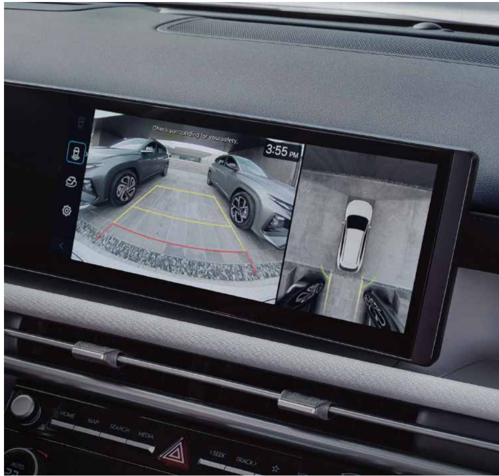
Surround View Monitor (SVM)