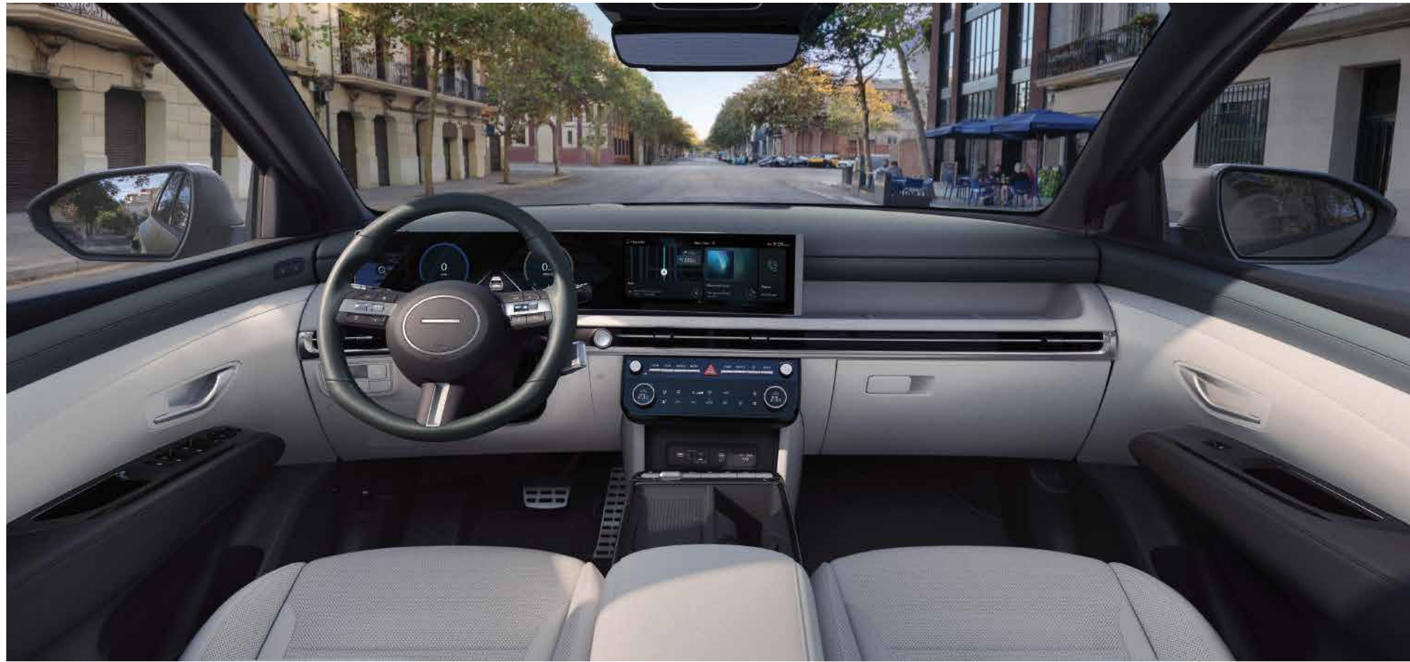
Wrap-Around Architecture Design

The cabin’s wide horizontal design wraps around the interior, enveloping the passengers with a seamless architecture that integrates technology and style.