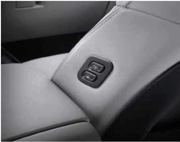
Integrated Memory Seat Walk-In-Device (Passenger)