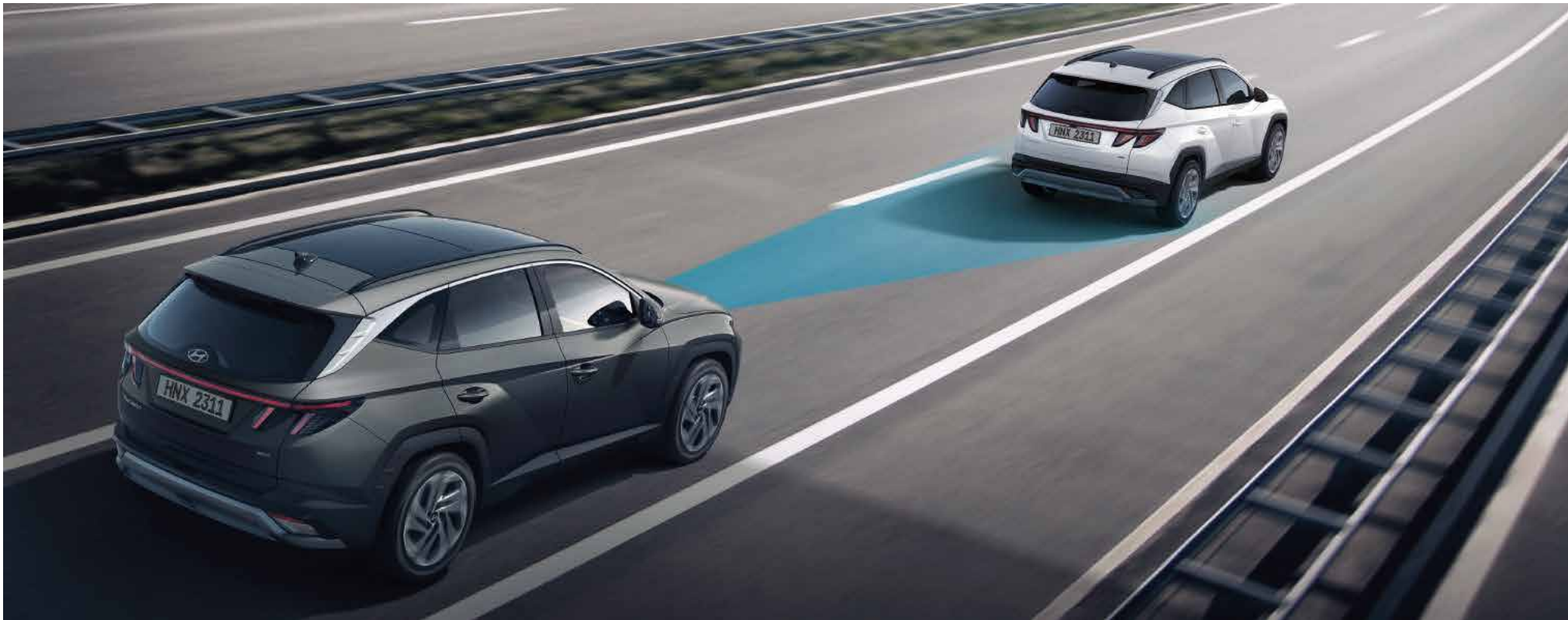
Smart Cruise Control (SCC) Smart Cruise Control (SCC) helps maintain distance from the front vehicle and drive at a speed set by the driver. Automatically stops when the front vehicle stops and automatically starts when the front vehicle departs within a short time.