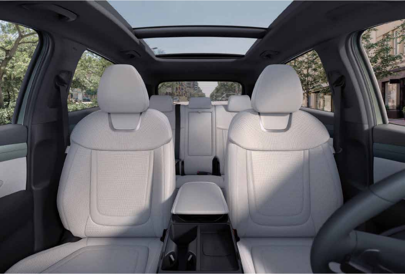
1st & 2nd Row Seat

Make room for more. Its best-in-class cargo space and roomy interior support various lifestyles and activities, offering more versatility than ever.