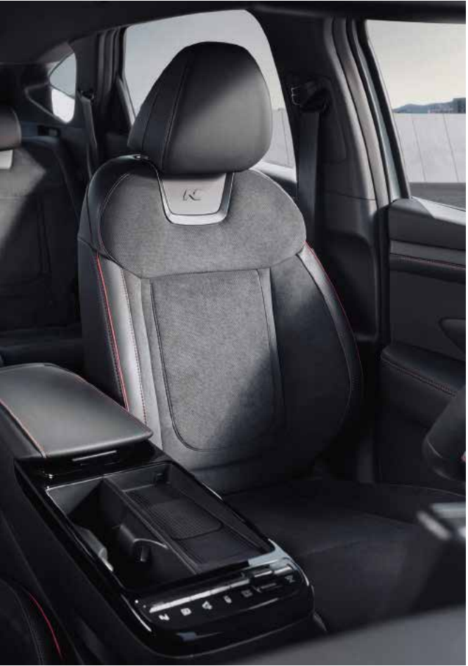
N Line-Exclusive Suede Seats