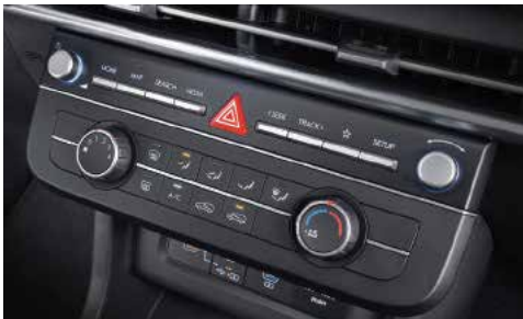
Manual Air Conditioning