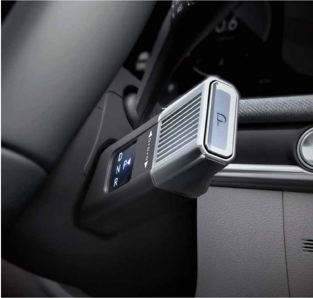
Column-type Shift by Wire (SBW)