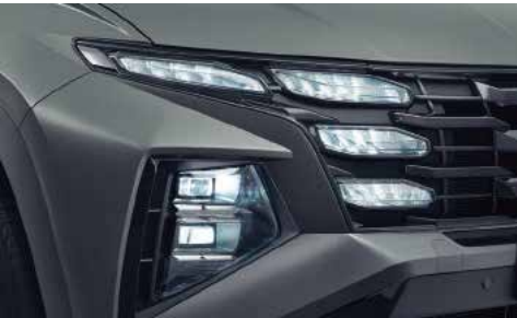
Full LED Headlamps (Wide Projection with IFS Function)