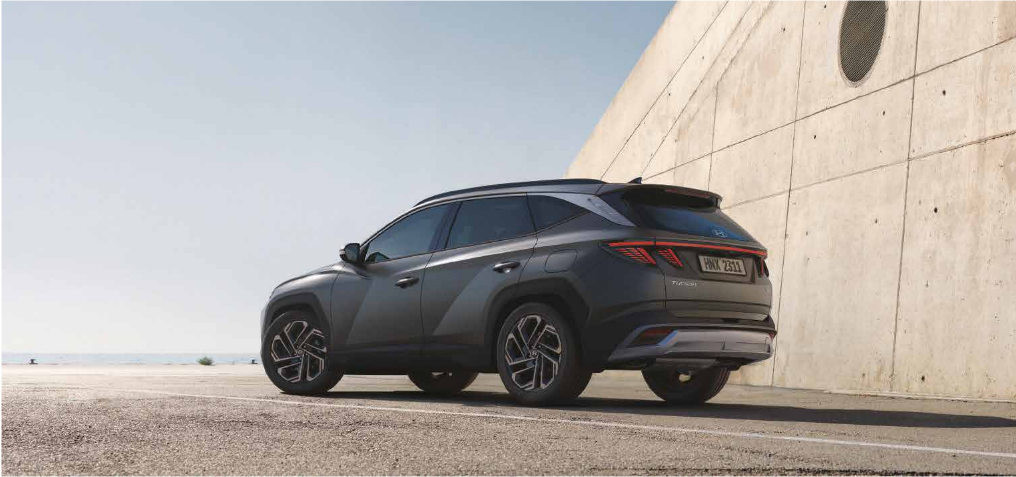
LED Rear Combination Lamps / Rear Bumper / Parametric Jewel Surfaces