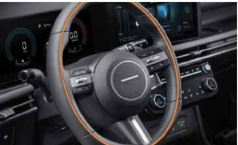
Heated Steering Wheel