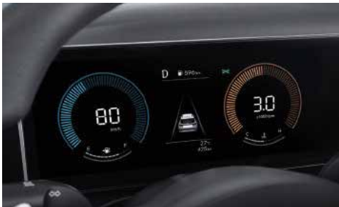
4.2-Inch Color LCD Cluster