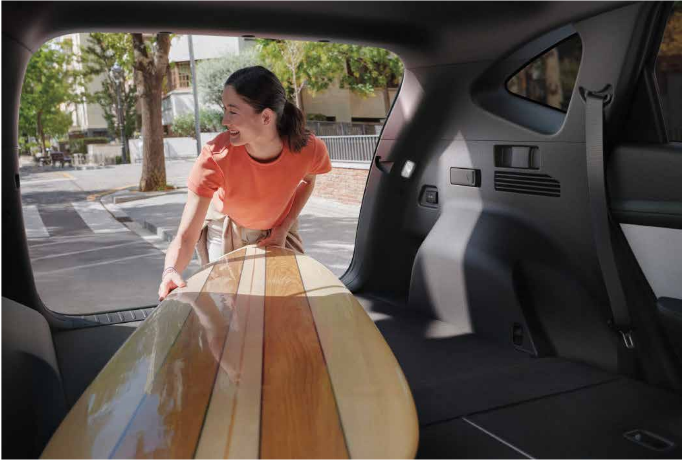
Folding Seats / Remote Folding System