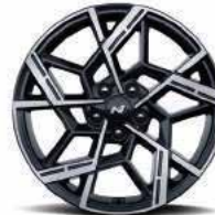
19" alloy wheels (N-Line)