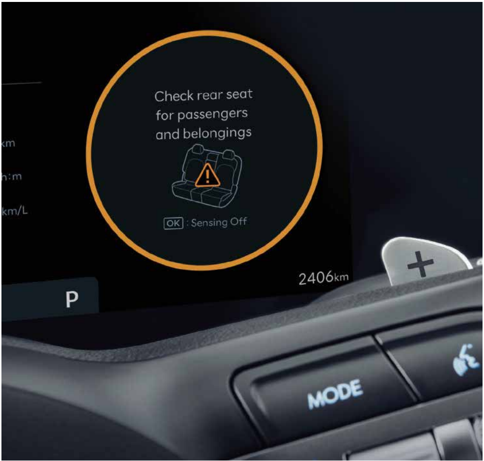
Rear Occupant Alert (ROA)