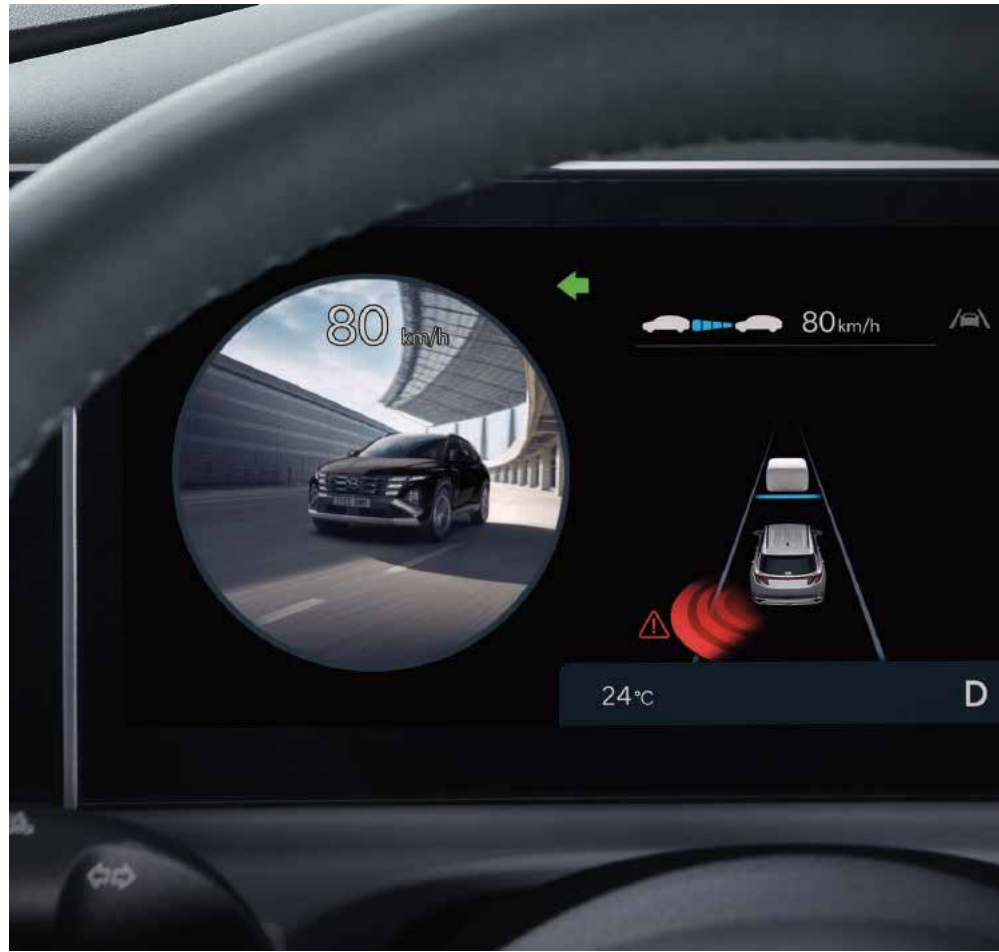
Blind-Spot View Monitor (BVM)

The new TUCSON is packed with reliable features to protect you from the unexpected and ensure you leave no one behind.