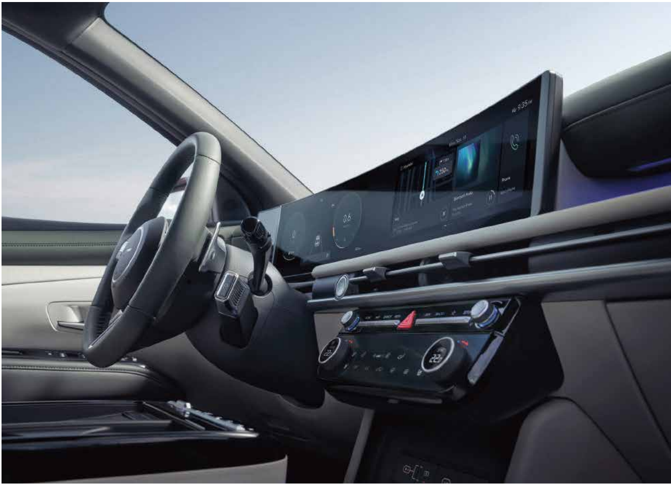
Panoramic Curved Display 12.3-inch (Cluster) + 12.3-inch (AVNT)