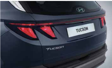
Rear Combination Lamps (Bulb Type)