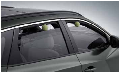
Safety Power Window