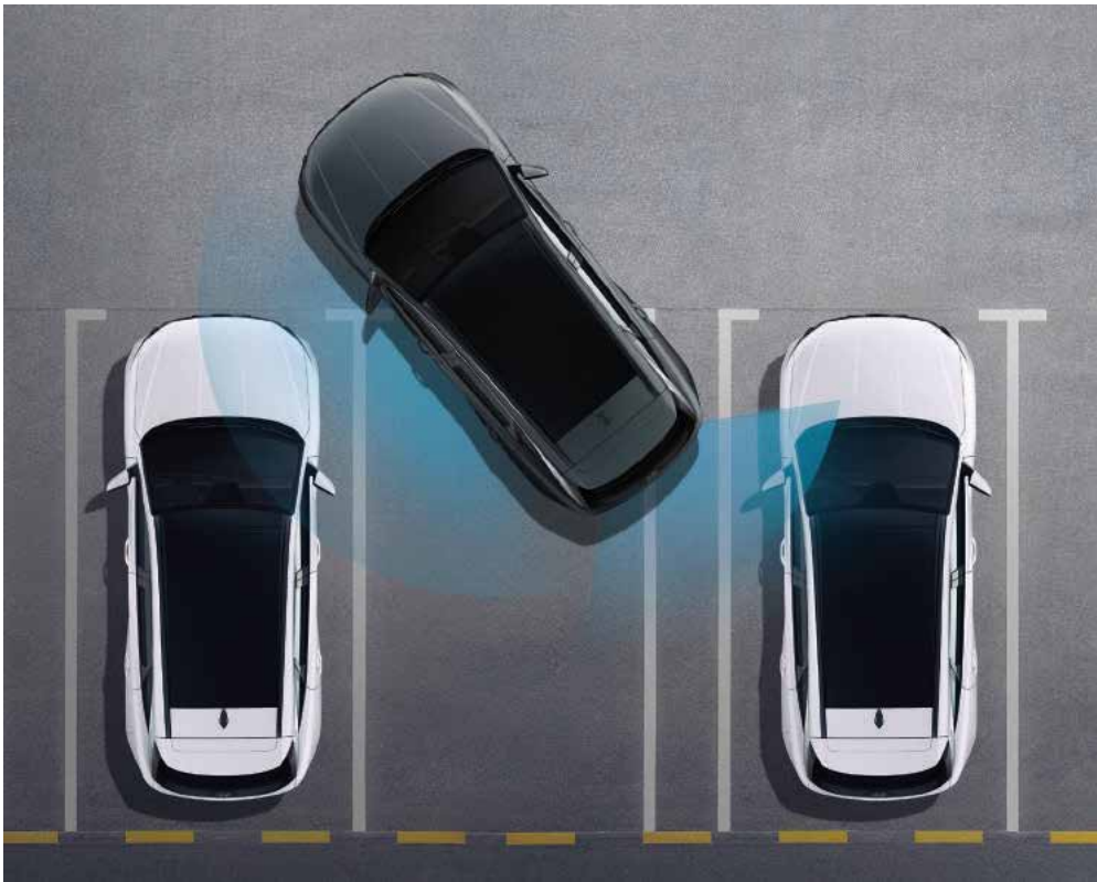
Forward/Side/Reverse Parking Distance Warning (PDW) Forward/Side/Reverse Parking Distance Warning (PDW) warns against collisions with objects around the vehicle at low speeds.