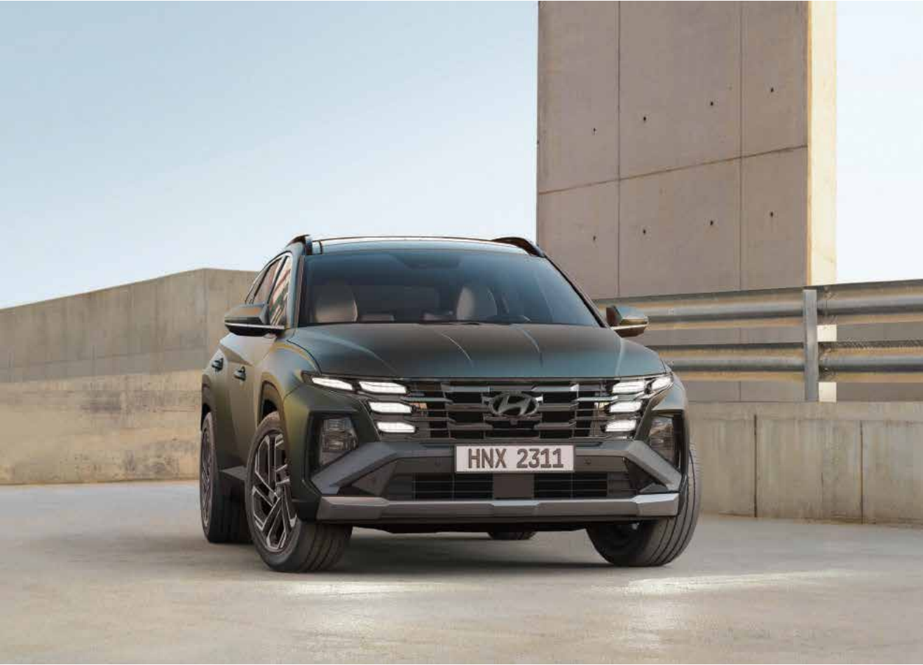
Parametric Jewel Hidden Signature Lamps / Radiator Grille / Front Bumper

Reject the ordinary with eye-catching jewel-like elements of the front lamps as well as around the sides - boldly upgraded to allow you to stand out from the crowd.