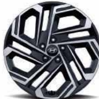
19" alloy wheels (Optional)