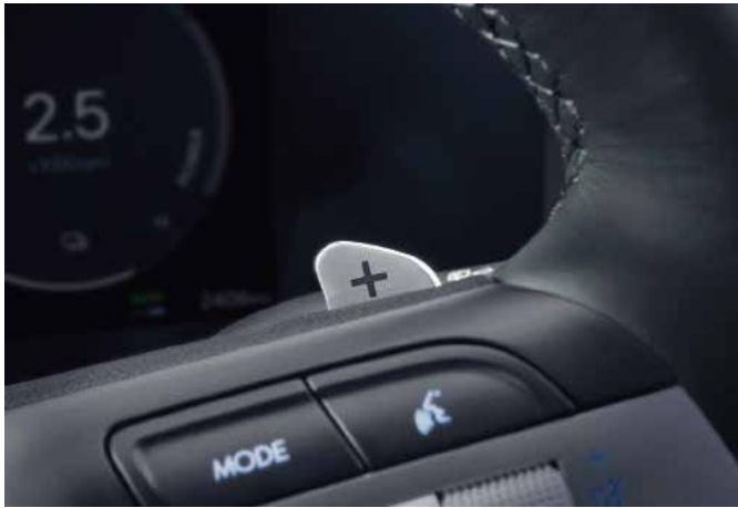
Hybrid Exclusive Features Paddle Shifter-Regenerative Braking Mode