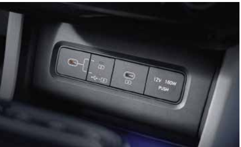
USB-C Data/Charging Ports