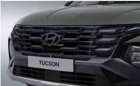
Dark Tinted Chrome Radiator Grille (Hidden Lighting DRL)