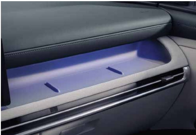
Ambient Mood Lamp / Multi-tray Floating-type Console