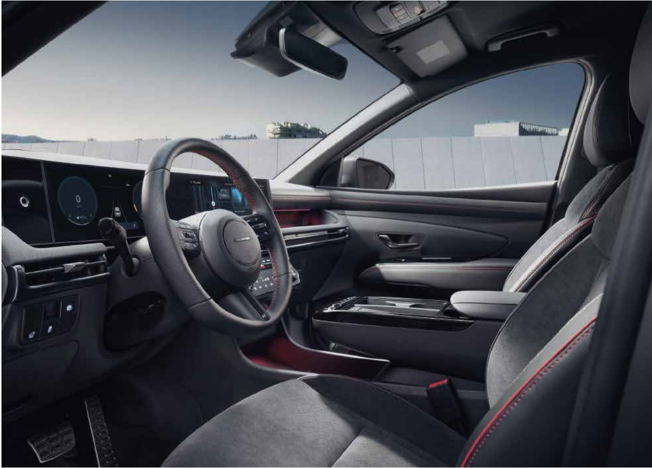
N Line-Exclusive Interior (N Line Emblem Steering Wheel / Red Stitching)