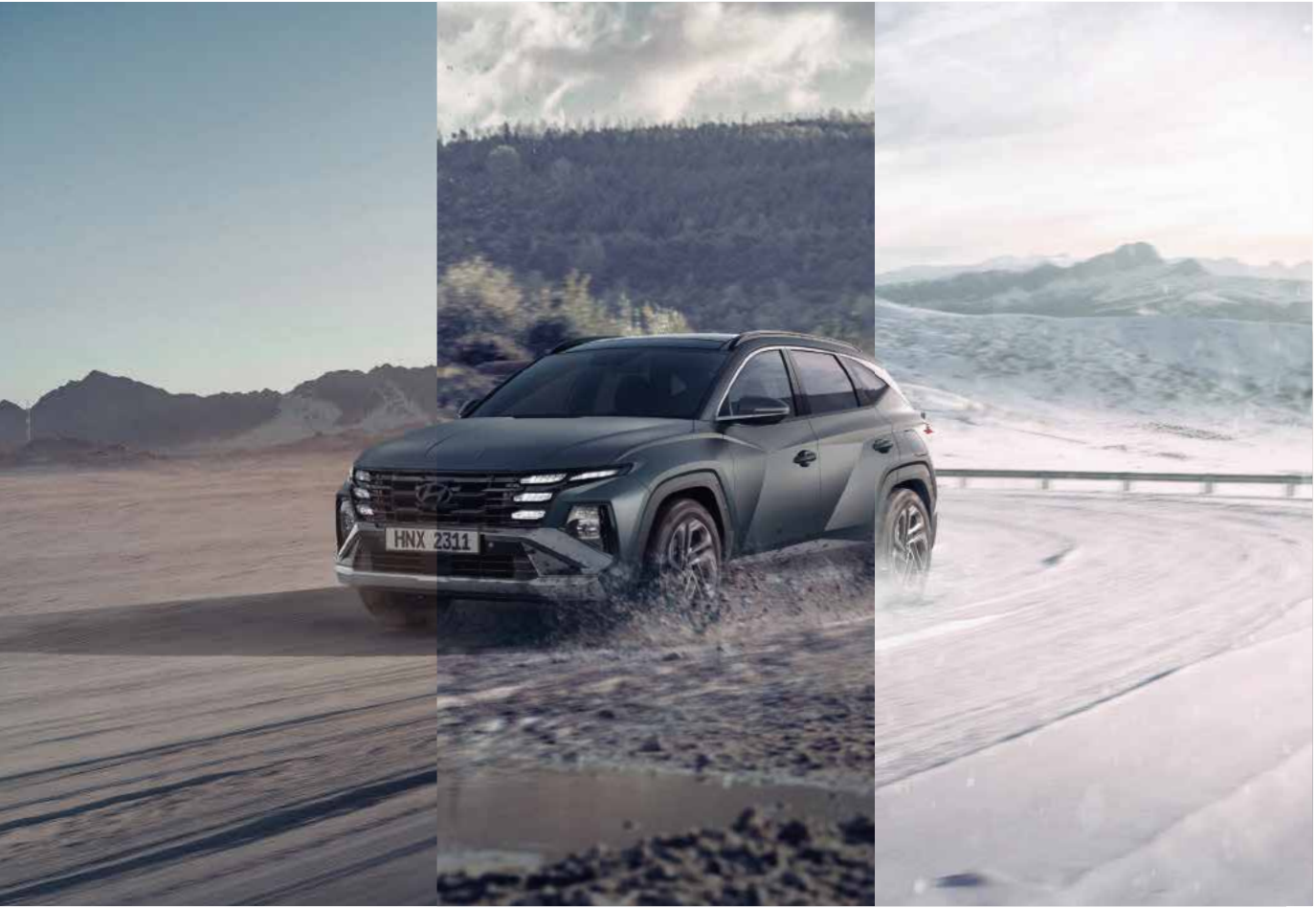
4WD HTRAC / Terrain Mode (Sand, Mud, Snow) TUCSON AWD provides optimal driving performance through actively distributing driving force to the front and rear wheels according to various driving situations.