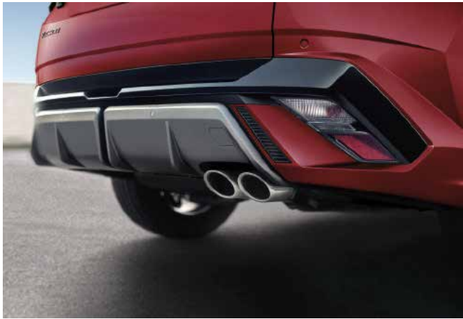
N Line-Exclusive 19-inch Alloy Wheels / Body-color Cladding N Line-Exclusive Single Twin Tip Muffler