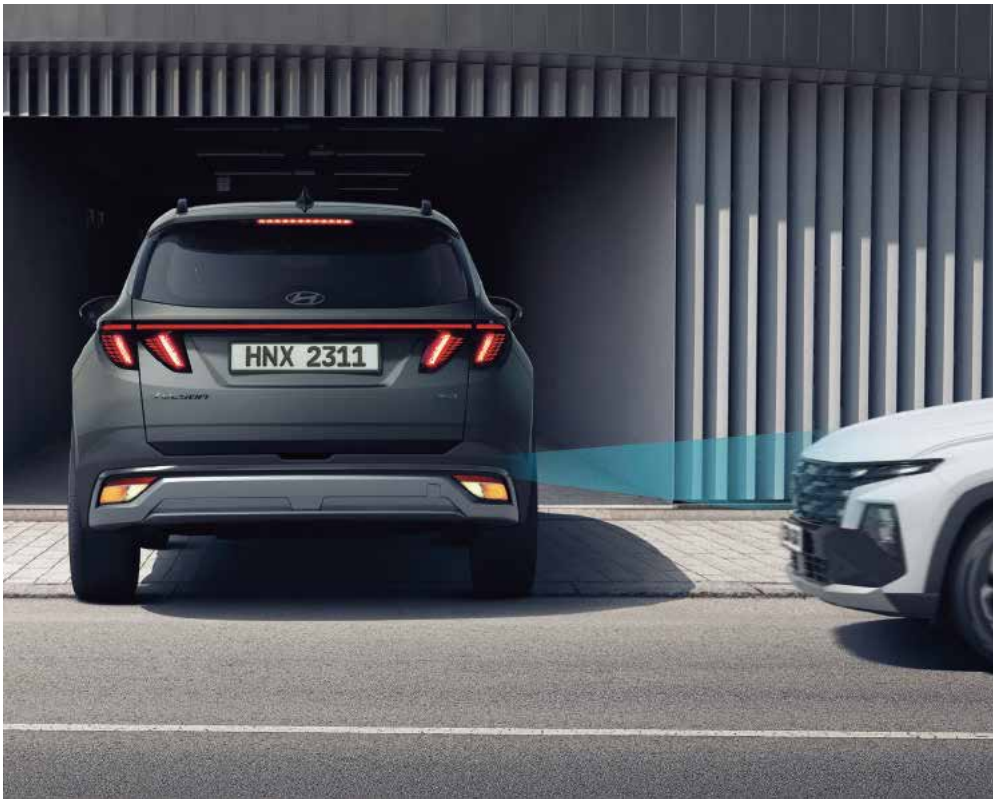
Parking Collision Avoidance Assist (PCA) Reverse Parking Collision Avoidance Assist (PCA) provides a warning if there is a risk of collision with a rear object while reversing. After the warning, if the risk of collision increases, it automatically assists with emergency braking.