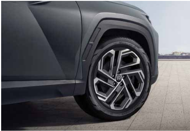
Roof Rail / Panoramic Sunroof 19-inch Alloy Wheels