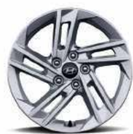
17" alloy wheels (Standard)