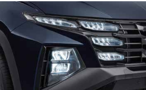
Full LED Headlamps (MFR Type)