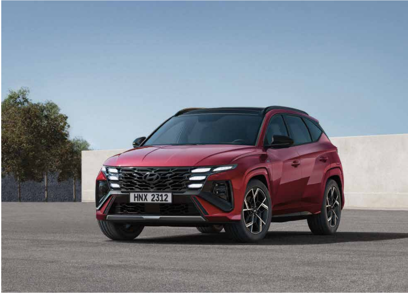
N Line Exclusive Radiator Grille

Packaged with an exclusive design, the new TUCSON N Line awaits those who desire that extra touch of sportiness.