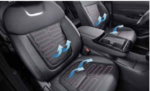
Front Heated and Ventilated Seats